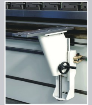
丝杆升降前托料(选配) Screw lift front material holder (Option)