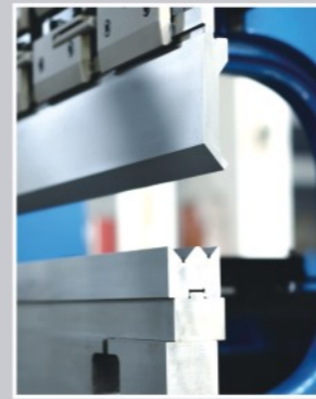
双V下模(选配) Double V die (Option)