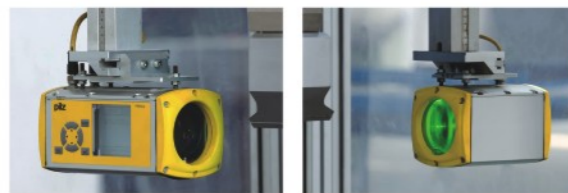
激光保护装置(选配) Laser protection device (Option)