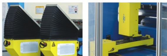
数控随动托料(选配) CNC following material holder (Option)