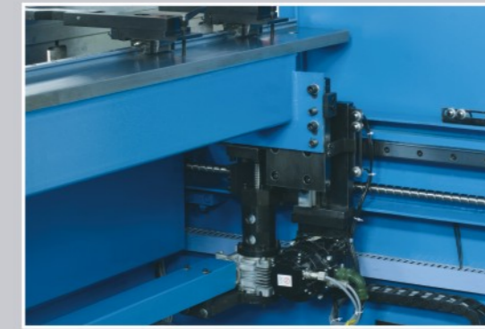
数控后挡料(选配) CNC backgauge (Option)